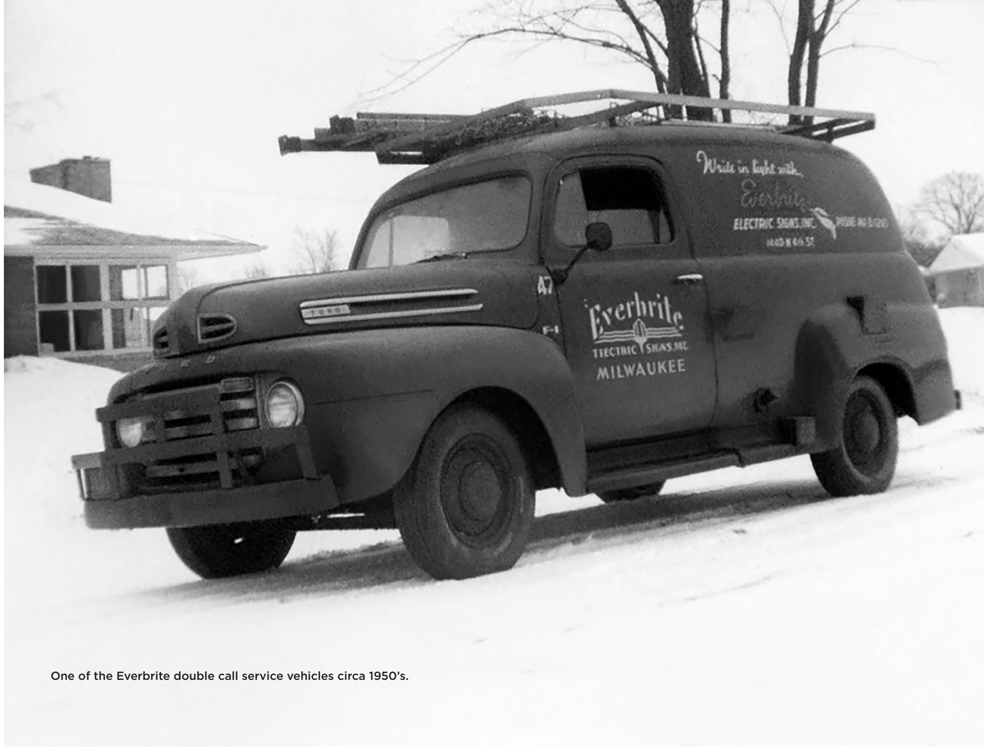
One of the Everbrite double call service vehicles circa 1950's.