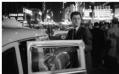
Film Still from "Sweet Smell of Success" by Alexander Mackendrick