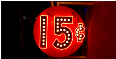
Tucson.