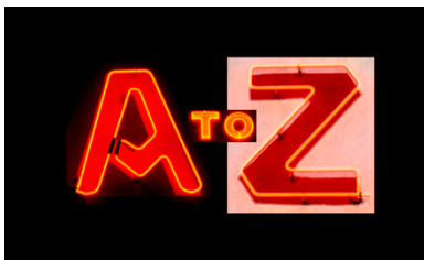
Artwork: SF Neon

From bamboo bars to the Pacific Ocean, take a virtual walk through the historic corridors of the outer avenues of San Francisco's Richmond District. This historic district is populated with vintage signs that light up the night to create a sense of time travel. The tour features historic photos, film clips, and ephemera with architectural and graphic design insights about San Francisco's "Outside Lands" surviving neon signs. Co-hosted by SF Neon and Nicole Meldahl of the Western Neighborhood Project.