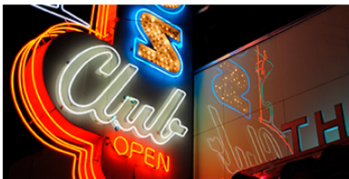
Carlos Club, San Carlos.