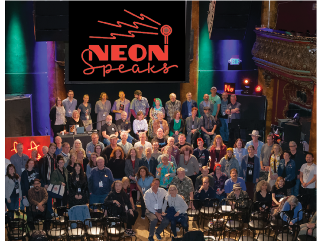
Neon Speaks 2019 at the Great American Music Hall in San Francisco.