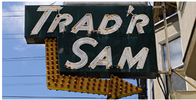
San Francisco.