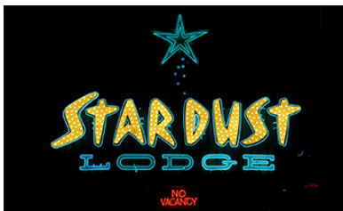
Lake Tahoe

The surviving neon gems of downtown San Francisco are survivors of a time when after-work nightlife was ablaze with neon. Hosted by the authors of San Francisco Neon: Survivors and Lost Icons , this neon-illuminated presentation investigates some of the oldest neighborhoods in the downtown district. Starting on Front Street and ending at Union Square, this tour features local history with architectural and graphic design insights.